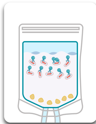
3 Separate Cells